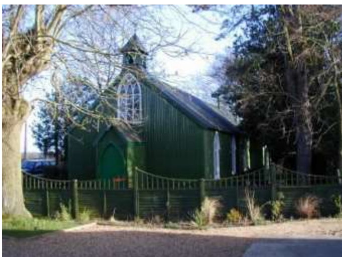
St Peter's, Littlebury Green

Building St Peter's is unique. Built in 1885 from a "flat-pack", its green corrugated iron exterior hides a wonderful pine board interior, retaining most of its original fixtures. In recent years, the roof, bell tower and windows have been renewed and a new small organ installed.