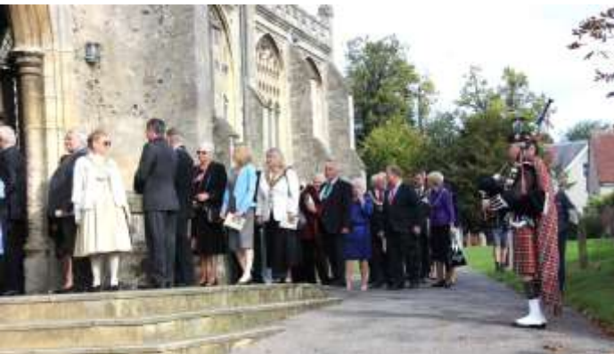
High Sheriff service

Our youth worker leads discussion groups at Saffron Walden County High School and participates in outreach events to several local primary schools with Stort Valley Schools Trust .