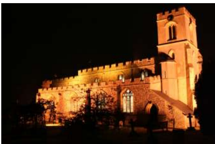
All Saints, Great Chesterford

but with a high proportion of young families and a number of vulnerable elderly. The church is kept open during daylight hours and is used regularly, not only by members of the congregation, but also by those in the wider