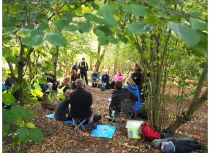
Little Walden - Forest Church

We have started having services in an outdoor space, which we call Forest Church . These informal services are offered to the congregation, village and wider community. They are held in a local nature reserve and have proved to be popular with young and old alike. The premise of the service is that we can deepen our connection with God in a natural environment.