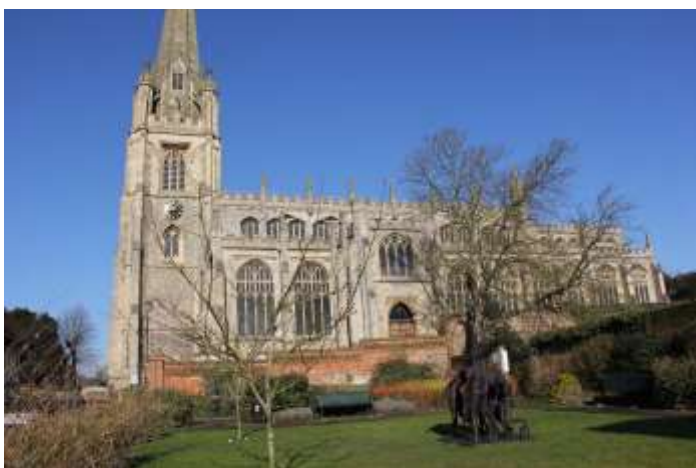
St Mary the Virgin, Saffron Walden

St Mary the Virgin is one of Essex's largest and grandest churches. It stands on a hill with a commanding position over the historic market town of Saffron Walden and can be seen as prominently from the North as the South. A Grade I listed church, it was built between 1450 and 1530 and is remarkable for the size and magnificence of the nave, the sense of height, and the light and openness of the interior.