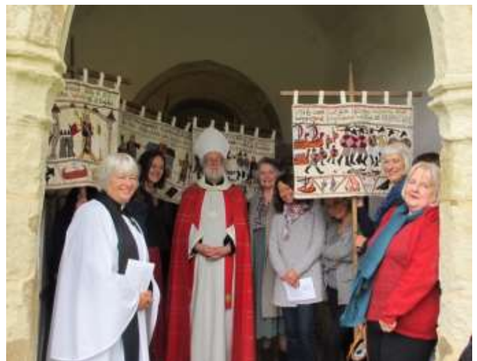
St Boltoph’s, Hadstock

Hadstock lies on the North West Essex/Cambridgeshire border approximately 1 mile from Linton, which is in the Diocese of Ely. It comprises 126 households with approximately 330 inhabitants with 41 people on the