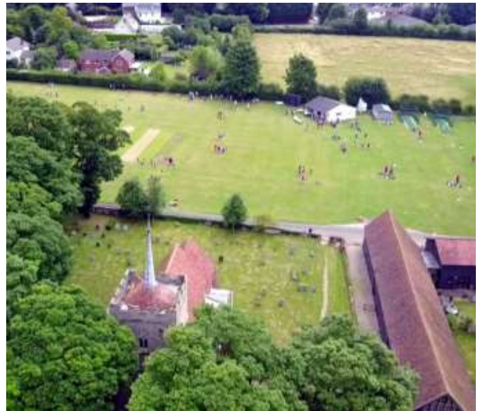
Wendens Ambo - church and cricket pitch

Buildings St Mary's is a Grade I Listed, largely mediaeval building, originally the church of Great Wenden; it can seat about 120 people. There are plans to alter the interior by the provision of a toilet and kitchen. There is a modern electric organ and a light ring of six bells rung in collaboration with bell ringers from the Team Ministry. The