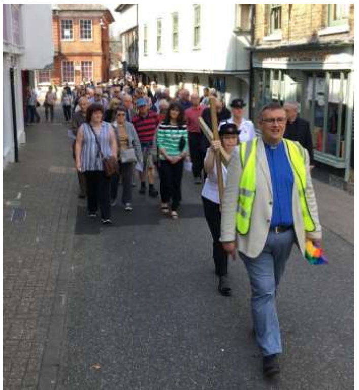
Churches Together: Good Friday Walk of Witness

The historically close association between the town and church continues and the Rector takes a lead in representing the Christian churches in the local community. St Mary's hosts civic services such as the Churaching of the Mayor, Remembrance Day, Holocaust Memorial Day, Christmas Tree services (with presents given to a children's hospice), and services for the High Sheriff, as well as services for the C of E primary school and many other local schools and organisations.