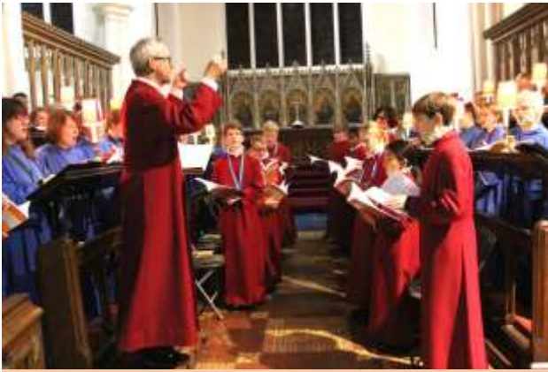
St Mary's, Saffron Walden choir