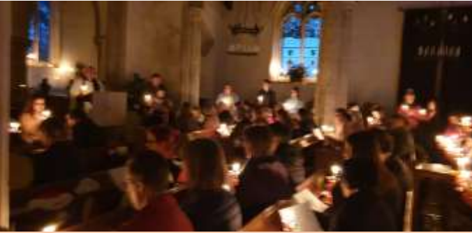
All Saints, Ashdon - Christingle service

People There is an electoral roll of about 60 people. We have a small group of willing volunteers who administer the Chalice and serve at Communion; Intercessions are written and read by members of the congregation; Lay people read the lessons; there is a rota of sides-people; we are also fortunate to have an experienced Verger - essential for Weddings and Funerals.