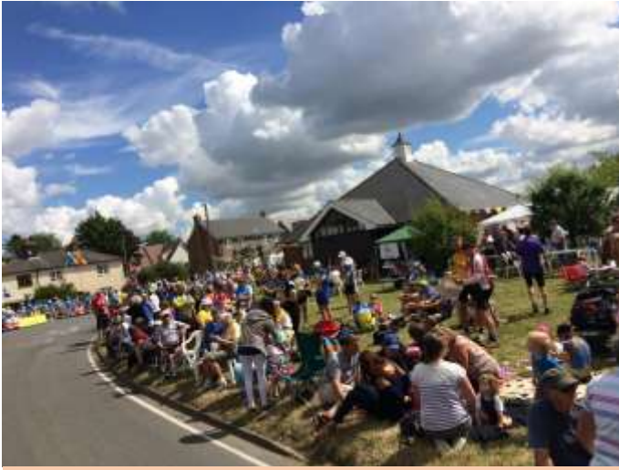
Swards End - Tour de France