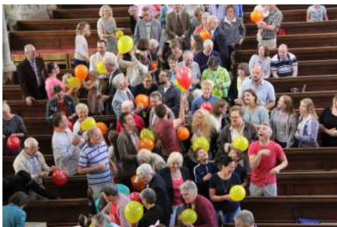
Pentecost family service

St Mary's plays an important role in the spiritual and civic life of the town, with an active congregation (300 on the electoral roll including the daughter churches of St James' Swards End and St John's Little Walden). Our mission is to share God's love, our full vision statement is set out in Appendix 4 . There is a full pattern of Sunday and weekday services, including services for families and children, and the church is kept open and well used during the day for private prayer. The average congregation at main Sunday services is around 200. The church is the hub and the springboard for many groups: social, pastoral, Christian nurture, children's and youth activities, all reaching extensively into the community.