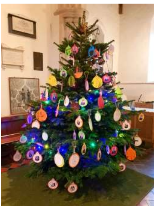
Wimbish - Christmas tree baubles

Community We have excellent relations with the local community school which holds an annual Harvest Festival Service and Carol Service at the Church. It has become a tradition that the children 'dress' the tree with 'baubles' upon which they have written a prayer, thought or biblical quote.