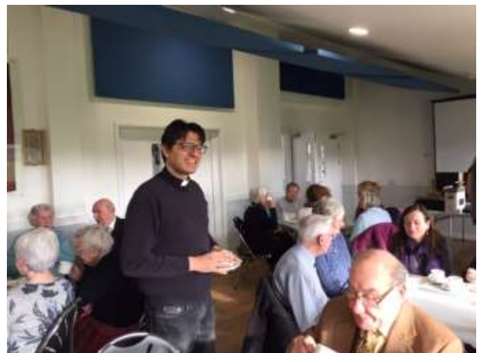
Combined Little and Great Chesterford service

The congregation has a small core of mostly older people, with others attending less frequently. Average attendance is around 10. Lay involvement in lesson reading, intercessions and service preparation is well established, and occasionally Morning Prayer is led by an Assistant Churchwarden. Bible study groups held jointly with Great Chesterford are well supported.