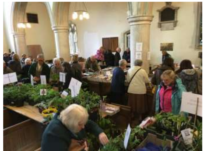
Debden Bring and Buy Sale

Community To appeal to all age ranges there is a monthly Church Mice meeting for pre-school children and their parents, when there are craft activities, along with a short service and refreshments. The Reception Class from the school attends once a term. As part of the church outreach, a monthly Lunch Club is held in the village hall. The church financially supports and makes regular contributions to the village magazine with a letter from the team vicar and a diary of events. The school holds end of term services in the church and has ownership of a church display board. The team vicar takes regular school assemblies. Remembrance Sunday is well supported by both the residents and army personnel from the local Carver Barracks. The school plays a prominent role in the Village Act of Remembrance. Family fun mornings have been introduced by the team vicar to foster links between the army and church communities.