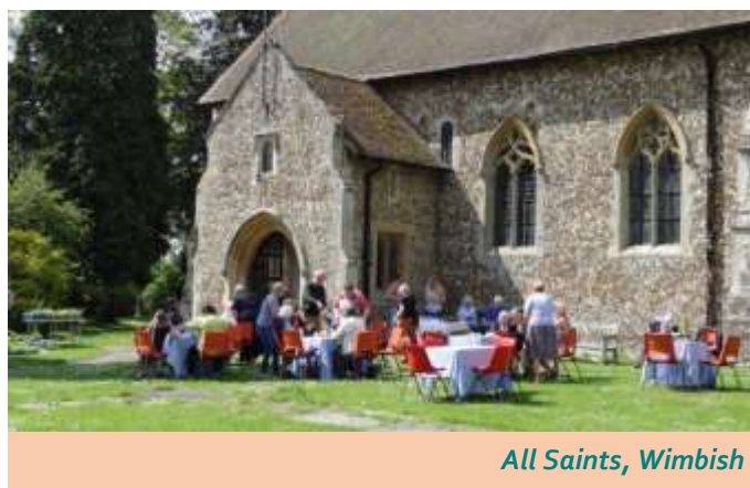
All Saints, Wimbish

The church pays its quota in full and although our finances are tight we manage to make ends meet by the generosity of a devoted congregation.