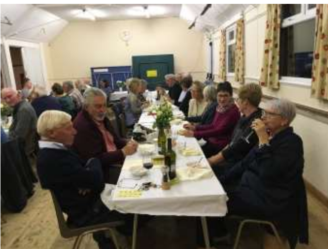
Debden Harvest Supper

Buildings The church is Grade I listed, at the end of a lane, a little way out of the village, and open daily. The oldest part is 13 th century. In the 18 th century, the