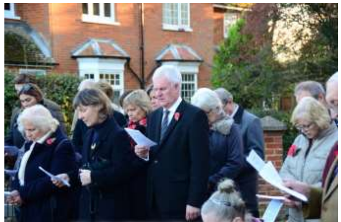
Swards End - Remembrance Day