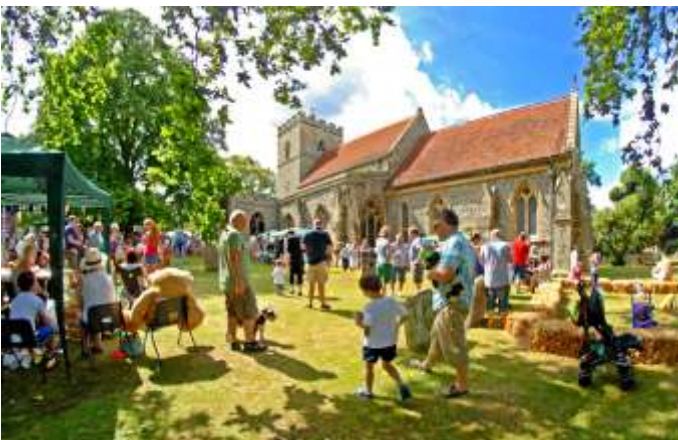
Littlebury fete