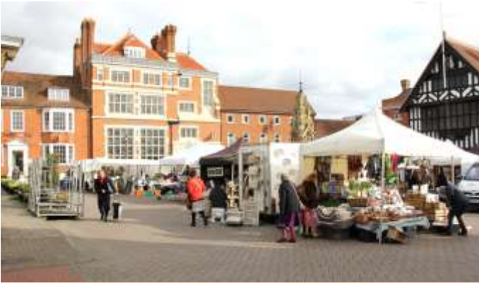
Saffron Walden market

Saffron Walden is an attractive, historic, East Anglian market town (population approximately 17,000) with a major conservation area and a large number of historic buildings. It has a flourishing twice-weekly market and many locally-owned shops and businesses. It has significantly expanded in the last 50 years and will need to adapt to substantial new housing and population growth in the next decades. Privately-owned housing is relatively expensive but there are significant areas of social housing and sheltered accommodation. It has much sought-after schools and is within commuting distance of both London and Cambridge and only 12 miles from London Stansted Airport (but not on the flight path).