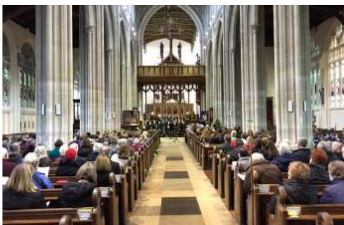
Holocaust Memorial Day service

St Mary's is a member of the Major Churches Network . It is a major tourist attraction for the many visitors whose numbers run into thousands every year drawn from many nationalities. The church hosts civic services such as the Churching of the Mayor and Remembrance Day, as well as services for the C of E primary school and many other local schools and organisations.