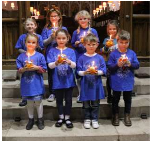
Joyful Noise Christingles

Rainbows, Brownies, Guides, Senior Section These Guiding units are affiliated to our church and meet weekly in the Parish Rooms.