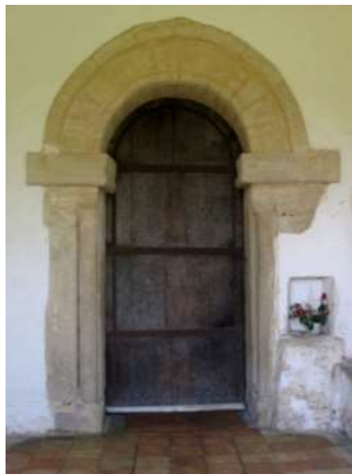
Hadstock: Oldest working church door in the country

Services and congregation Services are held Sundays at 9.30am (except 5 th Sunday) with an average congregation of 12. Morning prayers are said each Tuesday at 8.30am. A family service is held monthly. A Café style service is held in the Village Hall quarterly.