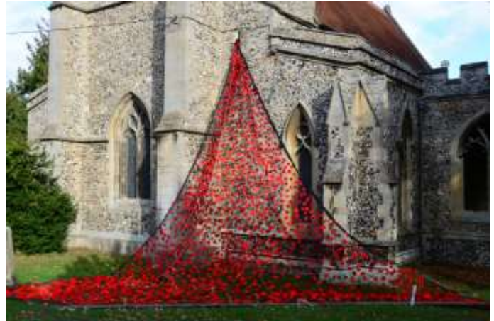
Holy Trinity, Littlebury: of poppies marking centenary of the end of WWI

Community It is the only community building in Littlebury Green and is made available for secular uses, including as a polling station. As part of its fundraising St Peter's organizes Littlebury Green's main annual community event, a summer outdoor barn dance.