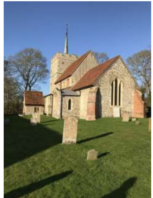
St Mary the Virgin, Wendens Ambo

The church is open daily. Its vision is to be at the heart of the village, welcoming and showing love for others.