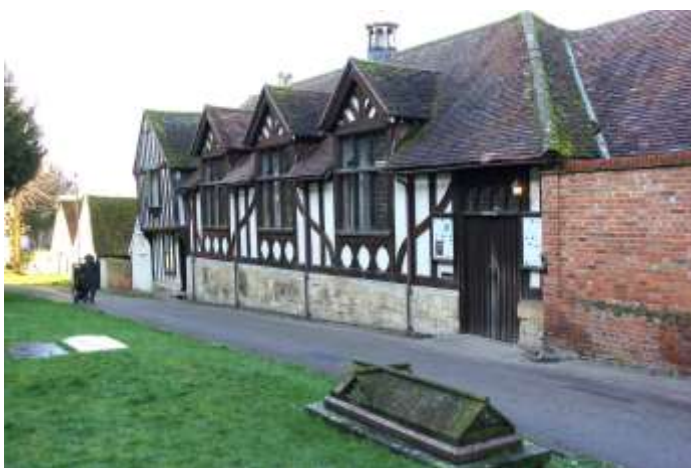
Parish Rooms & Verger's Cottage

St Mary's has retained strong links to the Saffron Walden Town Council: originally the Guild of the Holy