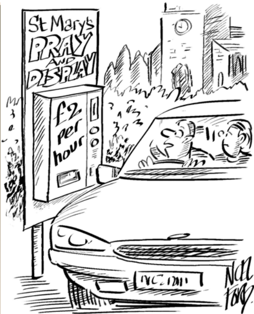
Yet another of the vicar's money-raising wheezes, I see