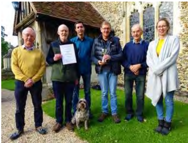
Photo of the winning Striking Competition band

programme of methods and ringing exercises designed to refresh our ringing skills. We have not quite managed to return to our pre-Covid form both in striking and method ability mainly due to missing some of our more able ringers who have not returned to the tower. We did, however, take part in the Essex NW District Call Change Striking Competition in October and were placed first of 8 teams.