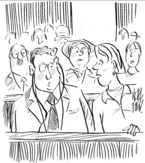
"But I said you'd be happy to lead a House Group this autumn"